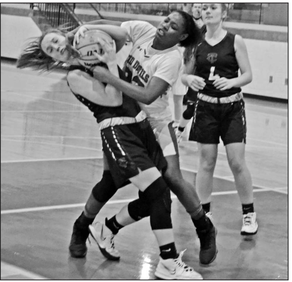
The Lady Indians battle for a rebound in the paint at Lincoln County.