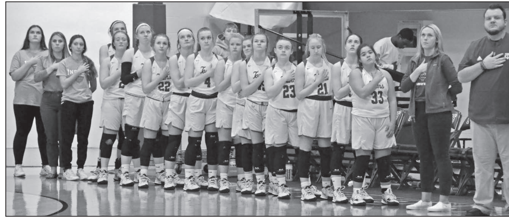
The Towns County Lady Indians ahead of last Friday's 53-32 home victory over Greene County.